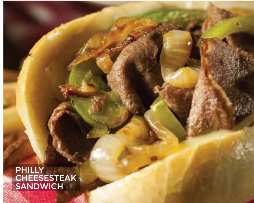
PHILLY CHEESESTEAK SANDWICH

STEAK SANDWICH 16.95 SEASONED STEAK SLICES TOPPED WITH OUR SPECIAL GARLIC PARMESAN BUTTER CRUST. SERVED ON A MAYO-DRESSED HOAGIE ROLL WITH LETTUCE, TOMATO, AND GRILLED ONIONS.