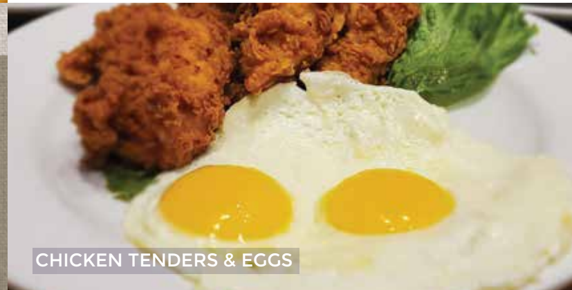
CHICKEN TENDERS & EGGS

CHICKEN TENDERS & EGGS 16.80 4 CHICKEN TENDERS, 2 EGGS & 2 SIDES.