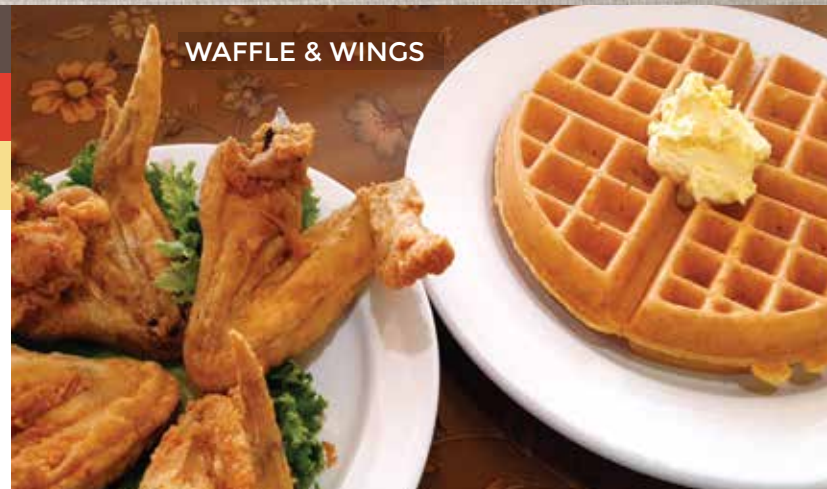
WAFFLE & WINGS

NO CHARGE TO SUBSTITUTE PANCAKES OR FRENCH TOAST FOR THE WAFFLE. SUBSTITUTE CINNAMON ROLL FRENCH TOAST FOR THE WAFFLE FOR $1.50 EXTRA. ADD CRUMBLLED BACON TO THE WAFFLE BATTER FOR $1.00 EXTRA. MAKE IT A CHOCOLATE BROWNIE WAFFLE FOR $1.00 EXTRA. ADD MIXED BERRY TOPPING & WHIPPED CREAM FOR $3.00 EXTRA.