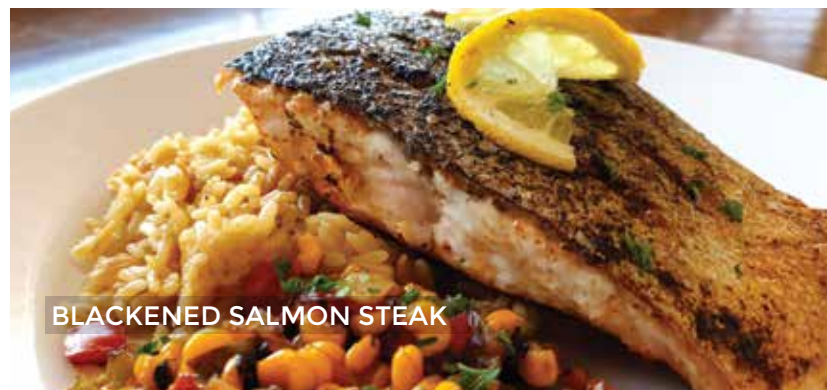
BLACKENED SALMON STEAK

SEAFOOD TRIO 22.15 CATFISH FILLET ROLLED IN KORNMEAL AND FRIED, COD BATTERED AND FRIED, AND FRIED SHRIMP. SERVED WITH CORN PUPPIES, TARTAR AND COCKTAIL SAUCES.