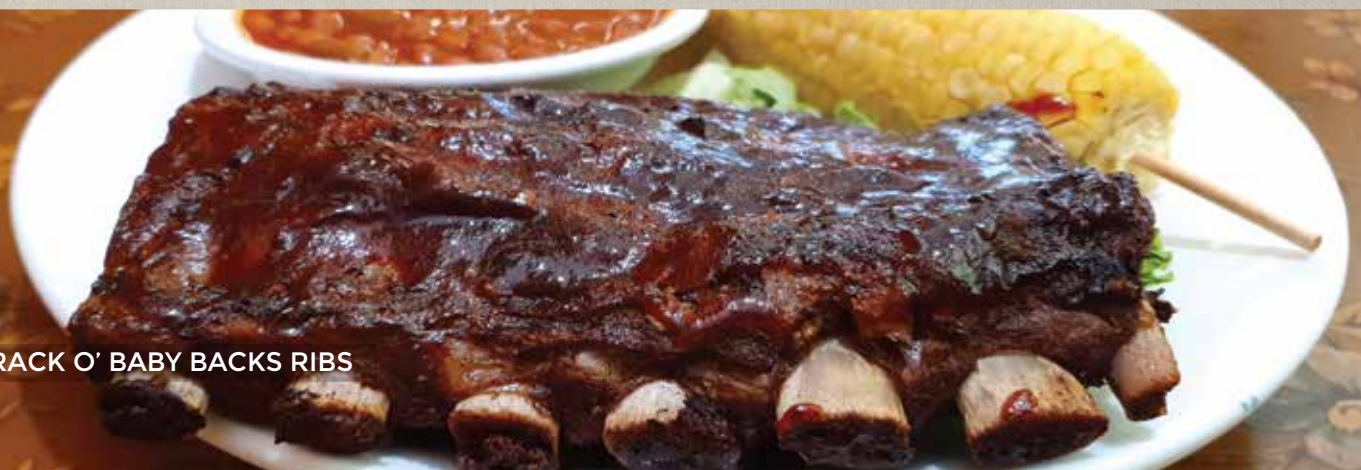
HALF RACK O' BABY BACKS RIBS

FRIED HALF CHICKEN N' HALF RACK O' BABY BACK RIBS. 30.45