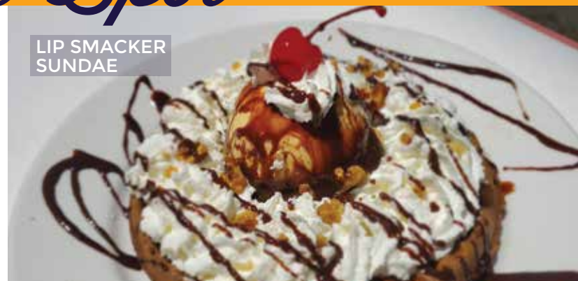
LIP SMACKER SUNDAE

ASK YOUR SERVER ABOUT OUR DELICIOUS PIES