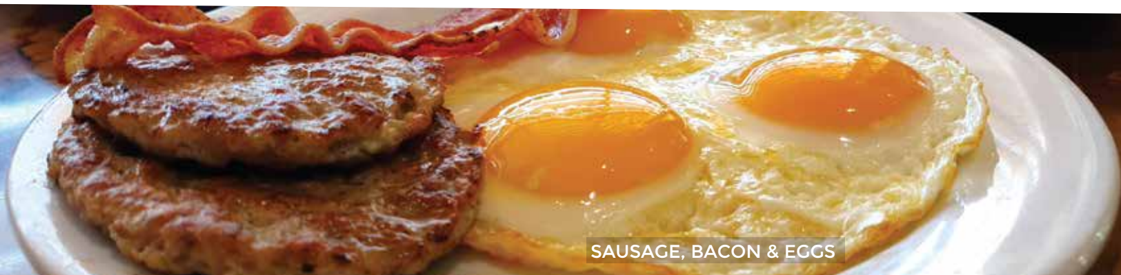
SAUSAGE, BACON & EGGS